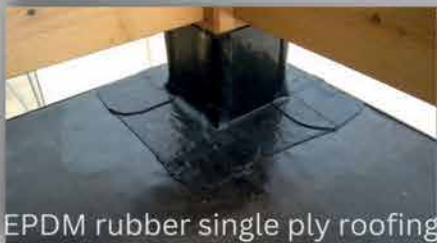
EPDM rubber single ply roofing

www.parkhouserofing.co.uk phone 01256 840103