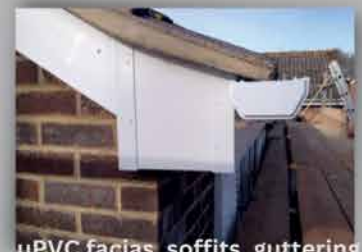
uPVC facias, soffits, guttering

Parkhouse roofing, your local roofing contractor for built up felt roofing, EPDM single ply rubber roofing, GRP liquid glass fibre roofing, uPVC facias, soffits, guttering, cladding and vertical tiling. We have been trading since 1986.