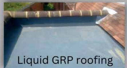
Liquid GRP roofing