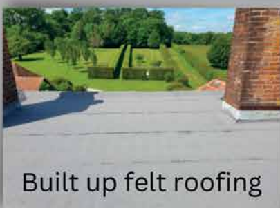
Built up felt roofing

Parkhouse roofing, your local roofing contractor for built up felt roofing, EPDM single ply rubber roofing, GRP liquid glass fibre roofing, uPVC facias, soffits, guttering, cladding and vertical tiling. We have been trading since 1986.