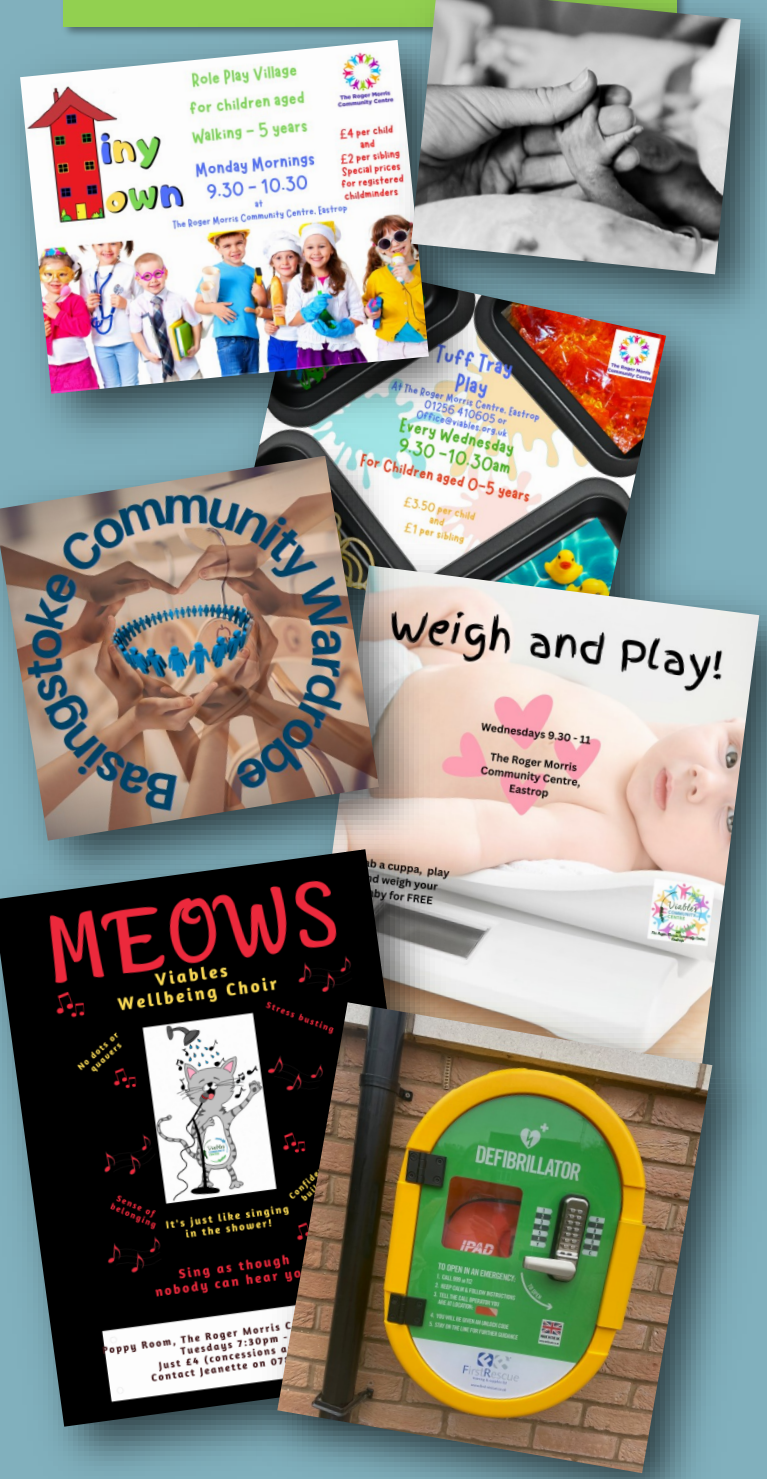
A new Defib has been installed at our Eastrop building using funding supported by ClIr Ronald Hussey

Please enquire for details 01256 473634 or 01256 410605 office@viables.org.uk