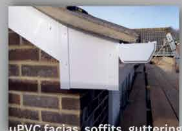
uPVC facias, soffits, guttering