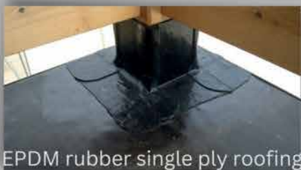
EPDM rubber single ply roofing

www.parkhouserofing.co.uk phone 01256 840103