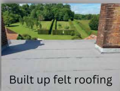
Built up felt roofing