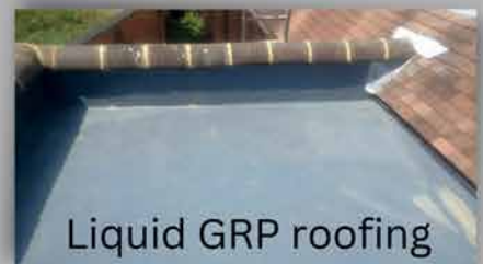
Liquid GRP roofing

Parkhouse roofing, your local roofing contractor for built up felt roofing, EPDM single ply rubber roofing, GRP liquid glass fibre roofing, uPVC facias, soffits, guttering, cladding and vertical tiling. We have been trading since 1986.